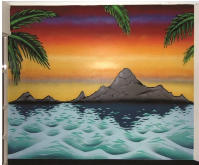
Island Paradise (Section of Alma Street Centre murals) 2015