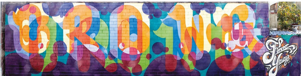
Forever Young (2014)