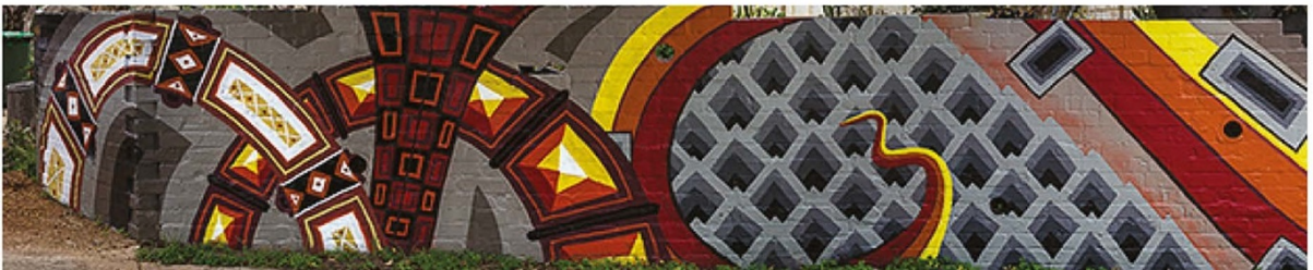
Geometric Jazz (2018)