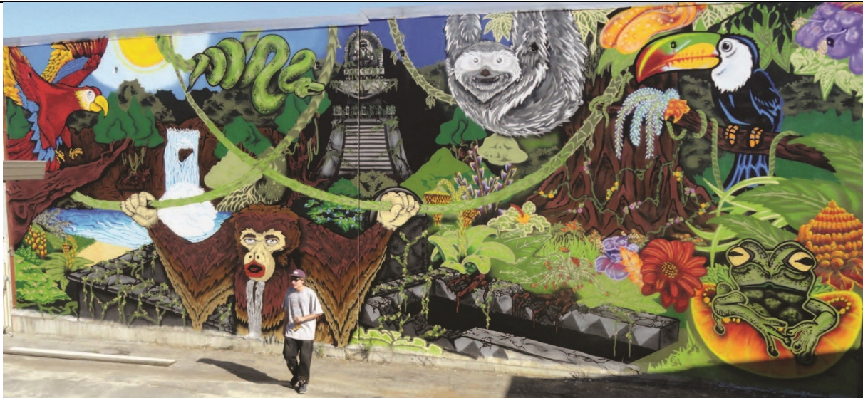
Welcome to the Jungle (2013)